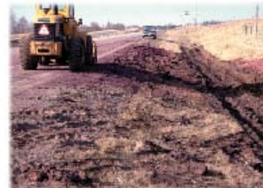
Frequent disturbance along roadsides provides opportunities for weeds to colonize and spread.