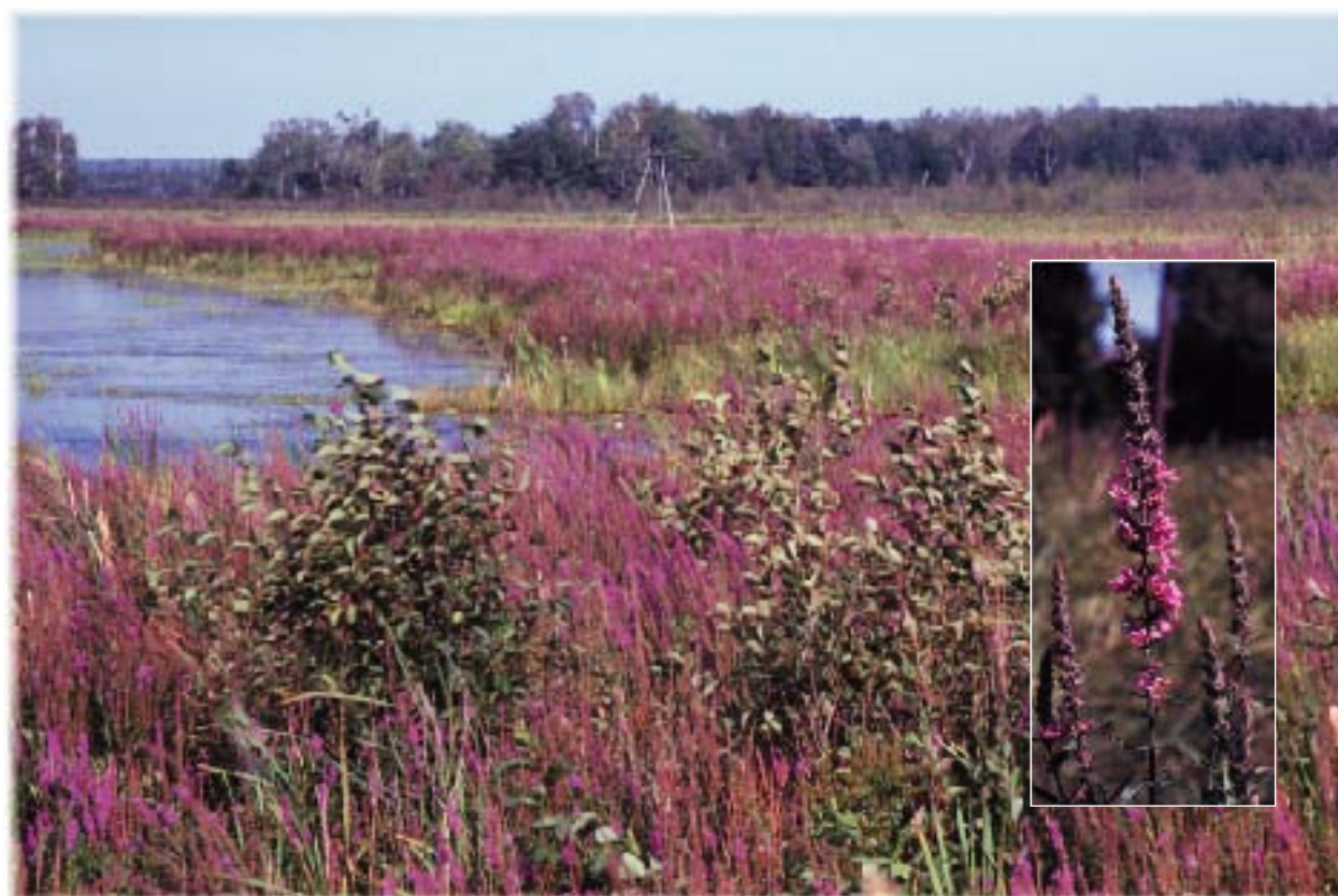
Once a popular garden plant, purple loosestrife is now illegal in many states because it invades and threatens our wetlands.

Can you meet this bill? Every year the costs associated with non-native weeds approach and exceed $35 billion in the United States alone. Source: Pimental, D et. al., 1999.