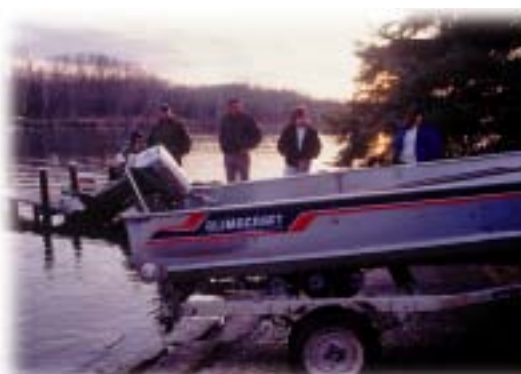
Many weed species hitch a ride on recreational equipment including boats, trailers, & ATVs.