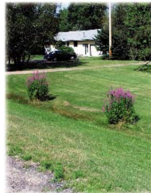
Landscape plants don't always remain confined to our yards.