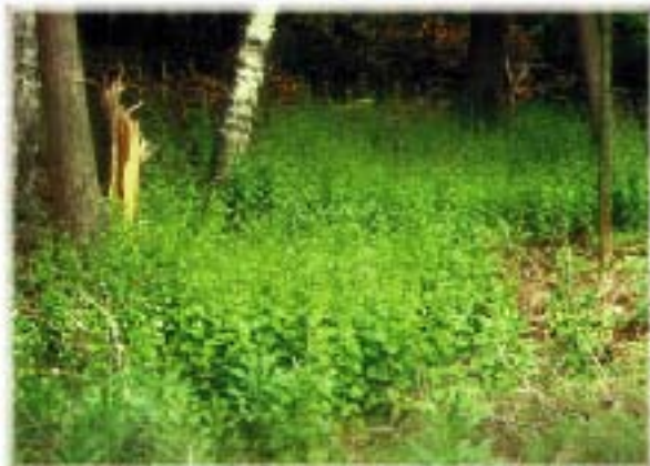
Even high quality forests can be invaded by garlic mustard, shading out the native understory herbs.

Invasive, non-native plants out-compete native plants, degrade fish and wildlife habitat, reduce agricultural yields, decrease gathering opportunities and hinder recreational activities.