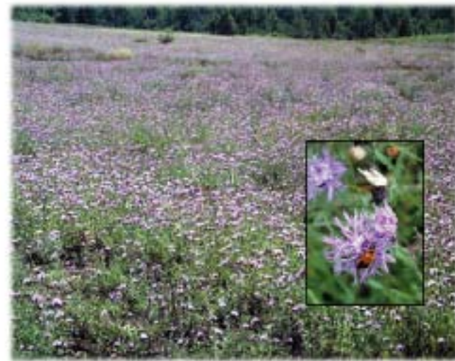
Spotted Knapweed overruns open pastures, barrens and rangelands.

A weed, by definition, is any plant that is unwanted and grows or spreads aggressively. When we hear "weed," we often think of dandelions. But many weeds are much more destructive than common lawn pests. Exotic weeds that overrun natural habitats, agricultural lands, and waters reduce biodiversity and burden our economy.