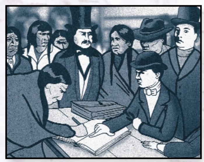
Annuity payment at Sandy Lake Indian Sub-Agency, 1850.