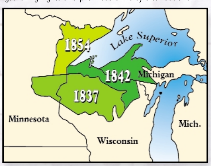
Ojibwe land ceded to the United States through the treaties of 1837, 1842 and 1854.

Five years later, Ojibwe headmen and government representatives agreed upon a 10-million-acre land cession that included portions of northern Wisconsin and Upper Michigan. The treaty opened the south shore of Lake Superior to lumberjacks, along with iron and copper miners. Similar to the previous 1837 arrangement, the 1842 Treaty guaranteed the Ojibwe's hunting, fishing and gathering rights and promised annuity distributions.